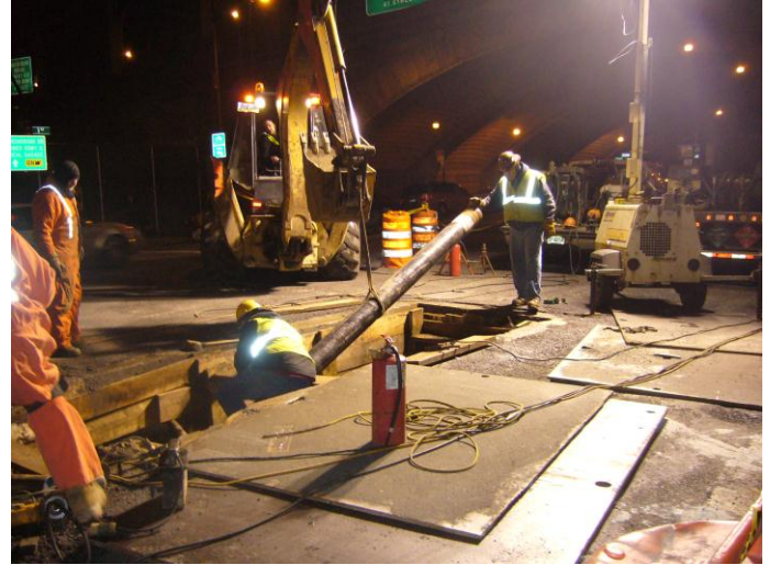
Workers perform 8-inch gas main installation on 1 st Ave. between E. 59 th St. and E. 60 th St.

Due to the New York City Department of Design and Construction's (NYCDDC) installation of construction safety barricades, access to the south curb line on East 59th Street between 1st Avenue and 2nd Avenue continues to be restricted. In order to ensure proper sanitation pick up, please remember to place all trash bags at the designated sanitation pick up point on the block. Failure to do so may result in 1) trash not being picked up, and/or 2) summons issued by The City of New York Department of Sanitation to the building in violation. Residential sanitation pick-up will be coordinated by DDC with The City of New York Dept. of Sanitation. All businesses are advised to contact their private carting company (as applicable) to coordinate private sanitation pick up. Please place your trash bags in the nearest designated area to ensure pick up.