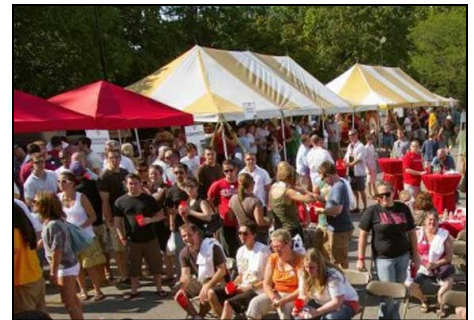
Bacon lovers enjoy food and fun at Bacon-Fest 2012.

On August 24th, R!KC will be holding its 5 th annual Bacon-Fest at their downtown location at 3010 Main Street. The only bacon festival in the metro area, Bacon-Fest offers 20 local food vendors who serve up creative bacon fare ranging from appetizers to desserts. Bacon-Fest will also feature live bands, a bacon-eating contest, and a bacon recipe contest. Don’t miss this fun opportunity to enjoy delicious food and support a local non-profit organization.