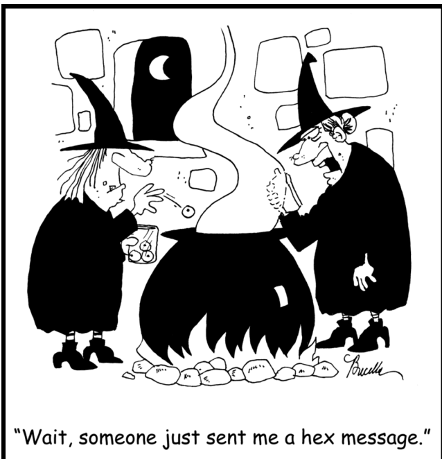
"Wait, someone just sent me a hex message."

Managed services , is a very general term that means one thing, you don't worry about IT anymore! Here is how it works. For one low fixed monthly fee, we take the helm. We proactively maintain and monitor your network for you 24/7, 365 days a year. We will keep your network safe, prevent disasters, and back-up your data. If you need us onsite to assist with new software, changes in your office, new equipment and more, we will be there in a flash. Our success is measured by your continued success. Our aim is to give you peace of mind, so you can focus on what counts... Your Business!