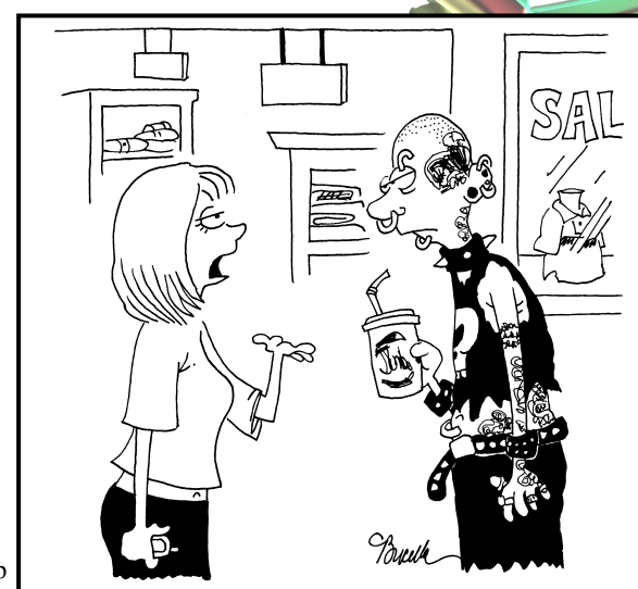
"I know it's a cry for help, but couldn't you just like say, 'Help?'"

If you want to save money, do your homework and ask for help if you need it.