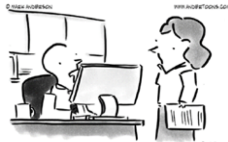
“As soon as I text, IM, tweet, and update my status to 'getting right down to it,' I'll get right down to it.”