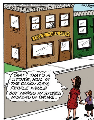
In the year 2030.