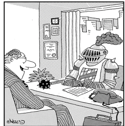
"Hey, no problem! I've always felt that a little sales resistance is a healthy thing!"