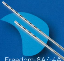
Programmer Wearable Antenna Assembly Freedom-8A/-4A Receiver