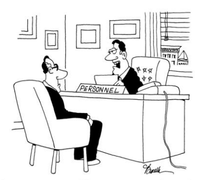
"Sorry, we just filled our 'Financial Analyst' position, but we do have an opening in 'Sacrificial Lambs.'"

Are Digital Devices Dumbing Us Down?.....Page 4