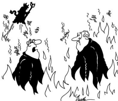
“I wrote assembly instructions for Children's toys. What did you do?”

Why Your “Not-To-Do” List Is Just As Important As Your “To-Do” List .....Page 4