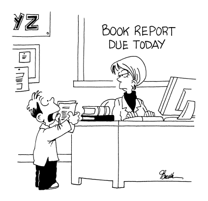
" A grade of 85 or higher will get you favorable mention on my blog."