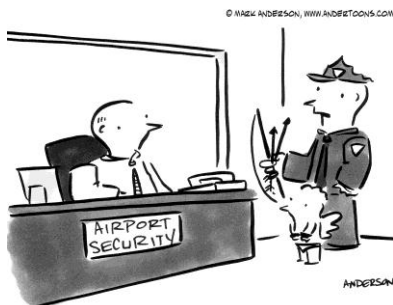
“He was trying to get on board with these.”

What To Do When Your Inbox Is FULL Of Important Messages You Don’t Want To Delete.....Page 4