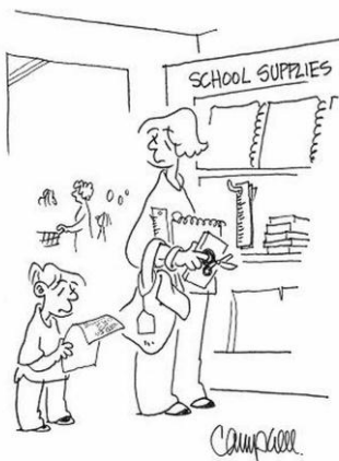
“...and right after scissors comes first aid kit.”