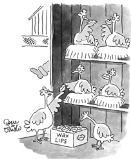
“Ok, here comes farmer Brown, put these on and remember.....act natural!”

Batman, Alfred And Your Assistant Job Description .....Page 4