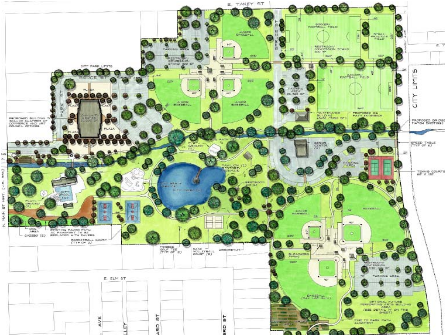
City of Bishop, CA Park Master Plan

Our planners routinely review and analyze development codes and policies and in order to identify goals and make practical policy recommendations for the community. We also provide to our private sector clients a range of development services including property analysis, project design and permit facilitation.