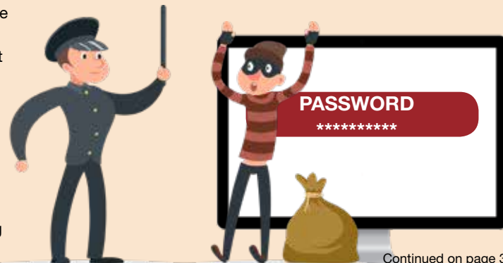
Continued on page 3

what their industry is and where they are located. You even need to know what's going on in their head: their values, concerns, priorities, tendencies and habits. Finally, you can determine what prompted a sale or triggered one of your core customers' initial engagements with your company, allowing you to be more strategic and specific with your sales processes. Inc.com, 12/20/2018