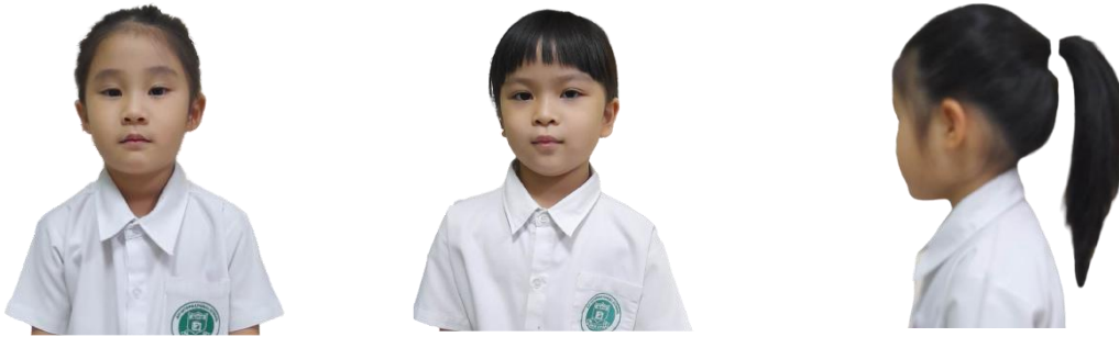
Boy's front and side view