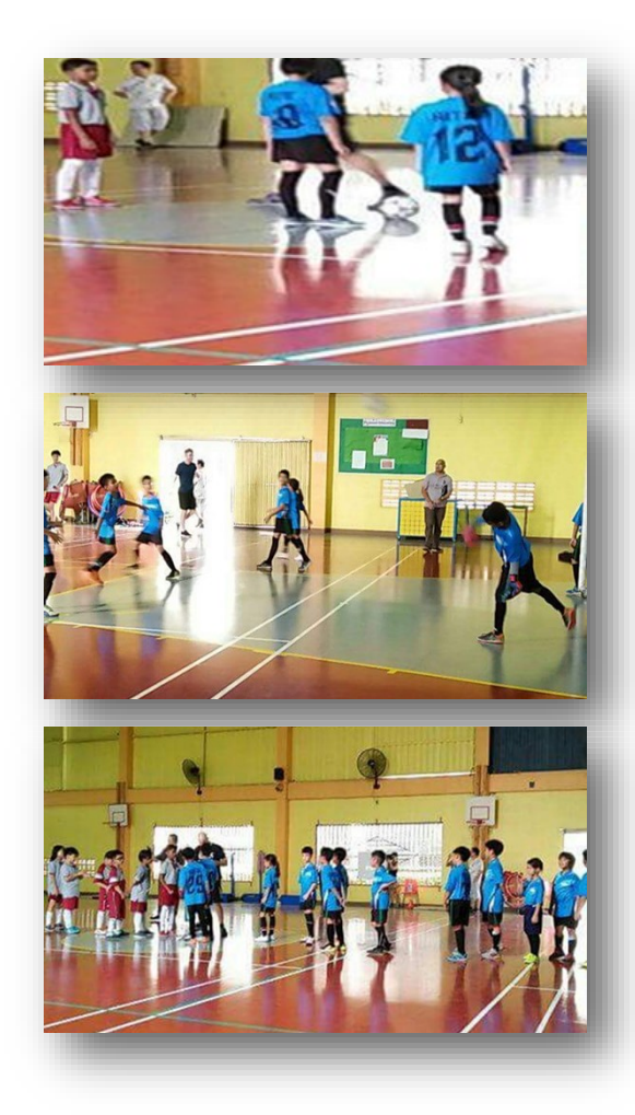
AITIS Bulletin, Volume 9, Issue 7, April 2018 12