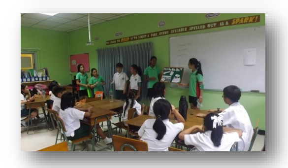
AITIS Bulletin, Volume 9, Issue 7, April 2018 {\bf 8}