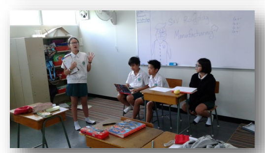
Language Arts Activity by Grade 6