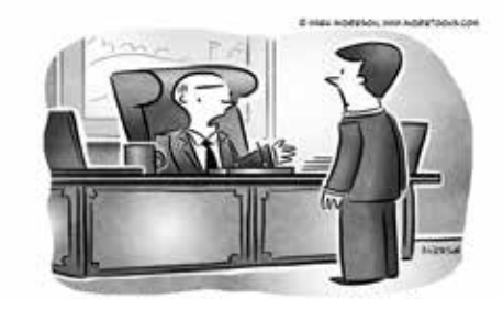
"Delegating? Don't we have people for that?"