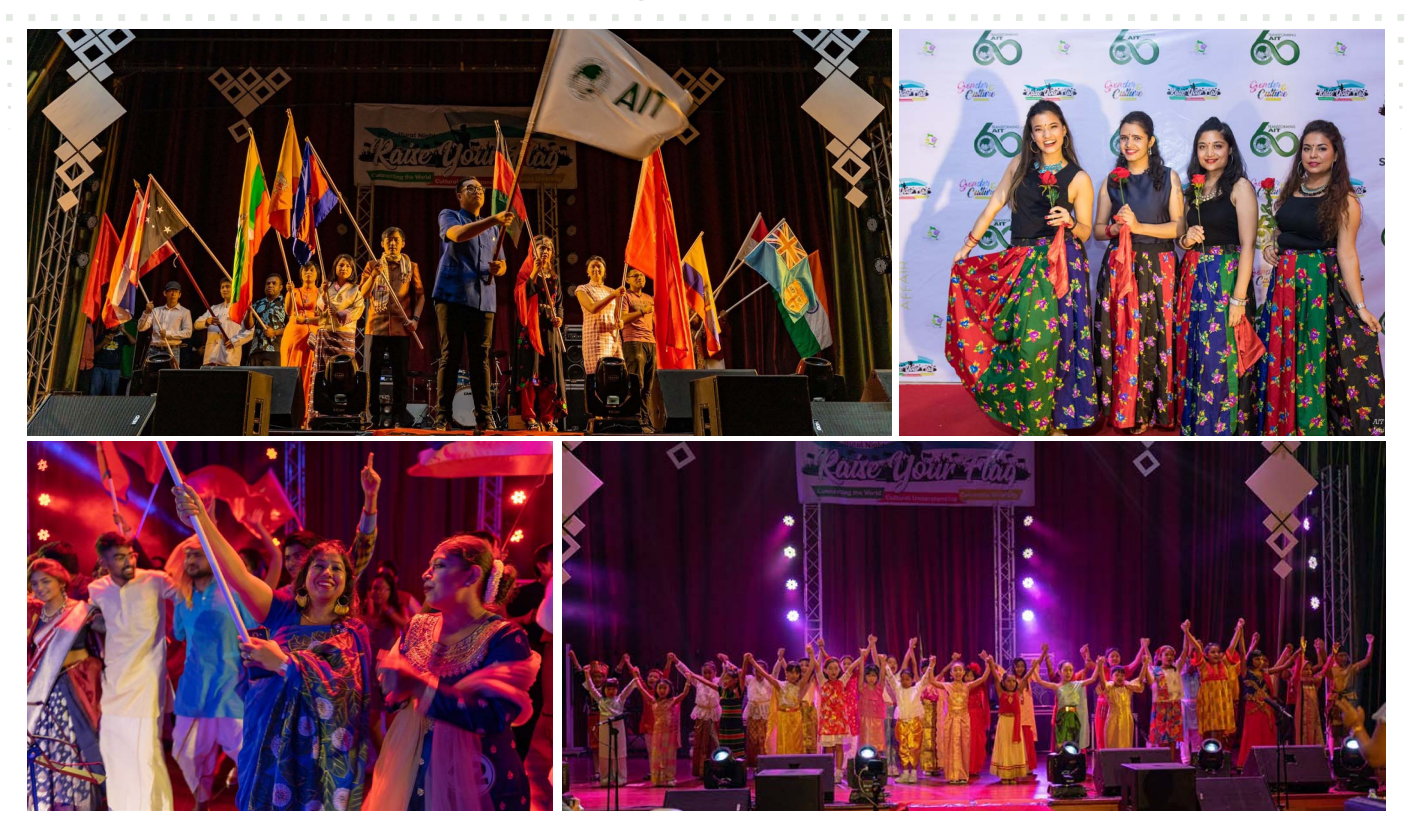
AIT Cultural Show August 2019: 13 September 2019

"Run for Health – Run for a Cause", Monsoon Marathon 13 September 2019