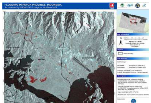
Red color depicts flooded areas.

AIT’s Geoinformatics Center (GIC) has taken the lead in providing emergency maps following the flood that hit Indonesia's easternmost province of West Papua. Torrential rains caused widespread flash flooding and triggered landslides affecting mountainside villages. Initial estimates placed the number of those killed at over 100, with the worst landslides occurring in the city of Jayapura. GIC was the project manager following the activation of the Disaster Charter.