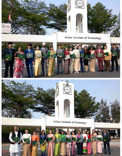
Recipients of the HM King's Scholarships (top), HM Queen's Scholarships and Loom Nam Khong Pijai (GMS) Scholarships pose at AIT Clock Tower

Twenty students from Thailand, 10 from Myanmar, five from Ne-