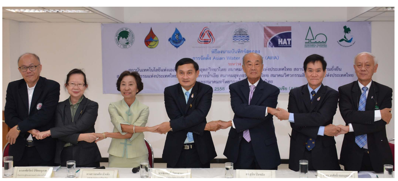
The MoU signing ceremony at AIT on 10 June 2015.