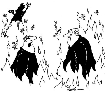
“I wrote assembly instructions for Children’s toys. What did you do?”

Why Your “Not-To-Do” List Is Just As Important As Your “To-Do” List