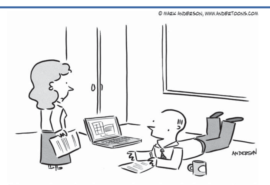
"I've tried regular desks, and standing desks, but I found just plain old laying on the floor works best for me."

If your child becomes the target, you can try to get your school involved, but many schools have been shot down, even sued, for trying to interfere. If the abuse becomes physical, sexual or threatens physical or sexual harm, call the police. The schools aren't equipped to handle that level of abuse. The police are.