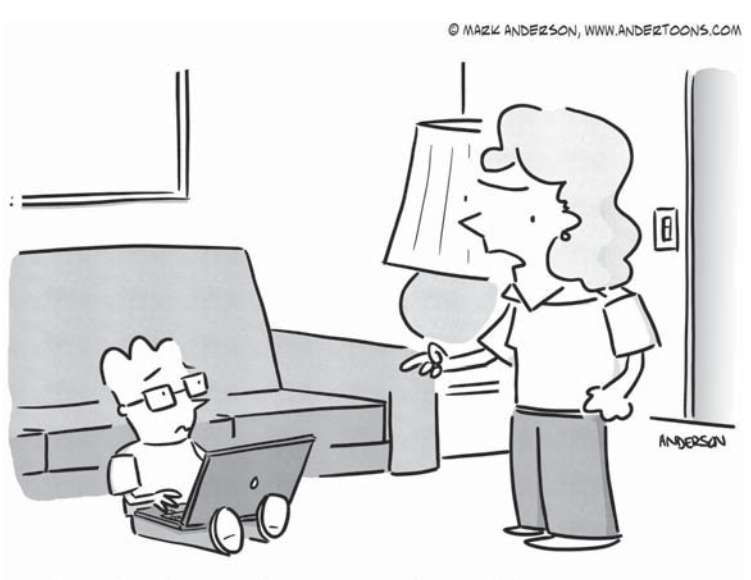
"Here's what you're going to do. You're going to give those 3 million people their credit card numbers back and you're going to say you're sorry."

Depending on your audience, Google+ may still be the best way to connect with your customers.