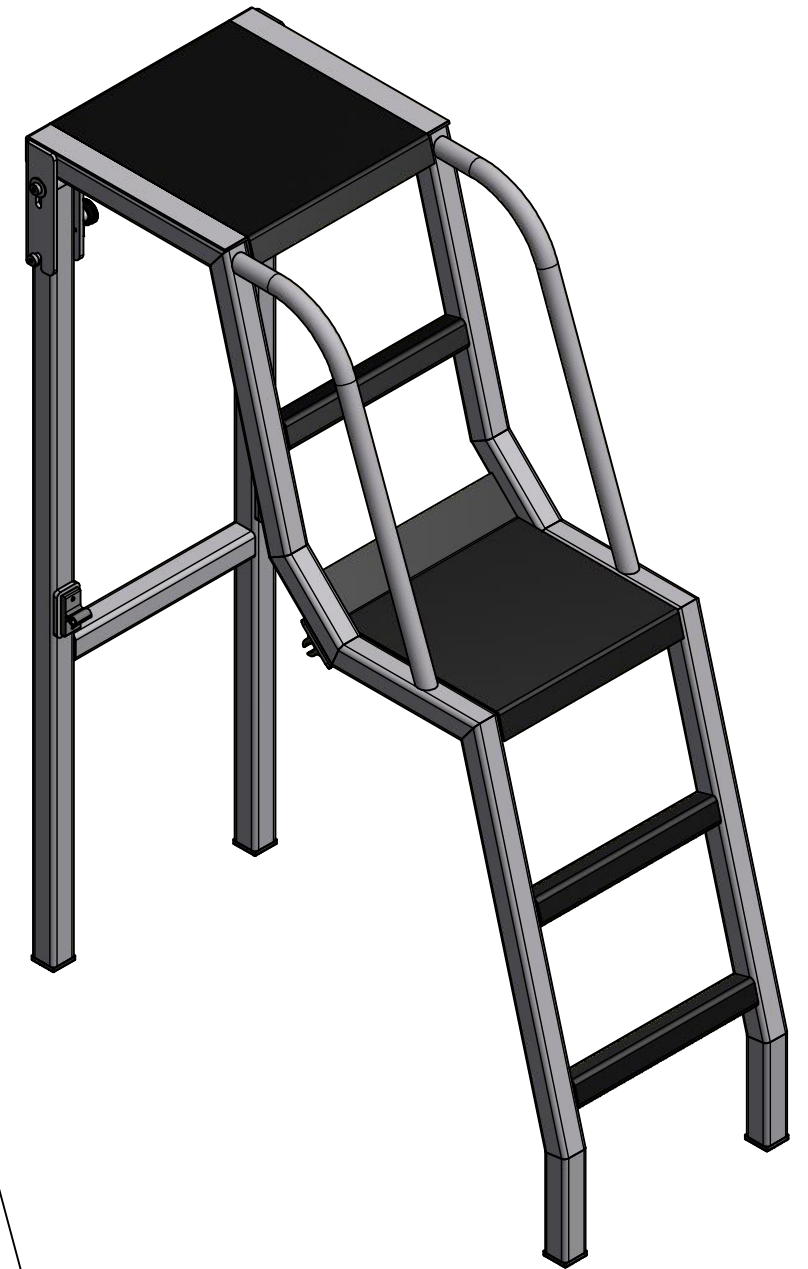
CABIN ACCESS STAND