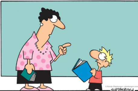
“It’s called ‘reading’. It’s how people install new software into their brains”

“Reading is to the mind what exercise is to the body.” — Joseph Addison