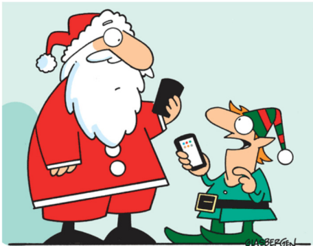
“Peace on Earth, good will toward men? There’s an app for that!”