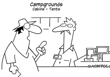
“My family wants a genuine back-to-nature camping experience, but with Wi-Fi, air conditioning, and satellite TV.”