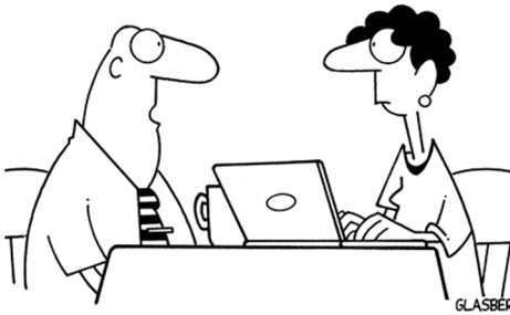
“My computer at work is so old, the keyboard only has dots and dashes.”