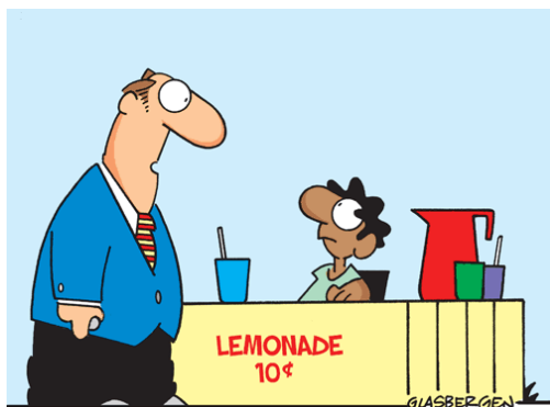
"If I buy a glass, do you promise to use the money to grow the economy, create new jobs, and support green initiatives?"