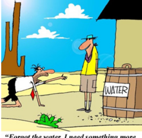
"Forgot the water, I need something more important. I need a cell phone and a laptop!"