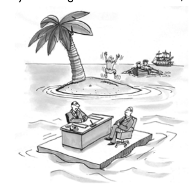
"Any problem working remotely?" (Continued on page 3)

It's also important to understand what resources will be available when you're working remotely. For example, if you are always working from a remote office, fast