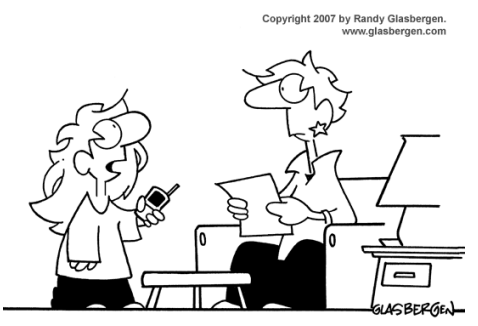
"My teacher isn't qualified to teach spelling! She spells U 'y-o-u'. She spells BRB 'r-e-t-u-r-n'. She spells BFN 'g-o-o-d-b-y-e'..."

What would your English teacher say about all this? Young and old alike take shortcuts when sending text messages. Recent studies show that texting may lead to bad grammar. No big surprise here! The big question is how this will impact acceptable business communications in the future. What will the future hold? idk