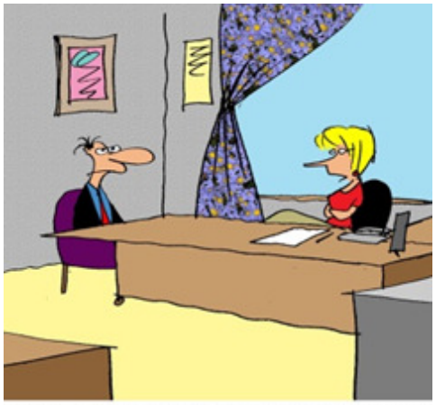
"I'm sorry, but I can't hire you. I typed your name in on a search engine, and lazy, selfish and unmotivated were the categories that came up."

More and more we are hearing about how employers and not hiring people based upon information and pictures they have seen on the Internet. You know those pictures...from that party...with those crazy people. Or, how about that Twitter rampage you went on about a political figure or religious belief?