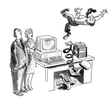
"It keeps people from surfing all day."

So, what should a leader do to address this issue? IT Radix recommends that organizations consider employing Internet monitoring software. This software should be viewed as just another facet of a larger security discipline which includes everything from