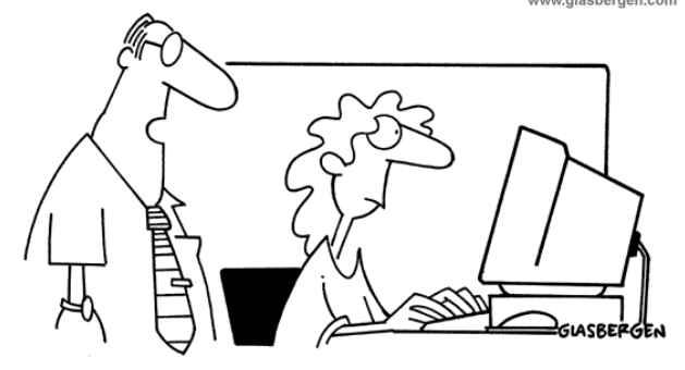
"We've established new security standards in the office, so don't forget to use the ecret-say ode-cay."