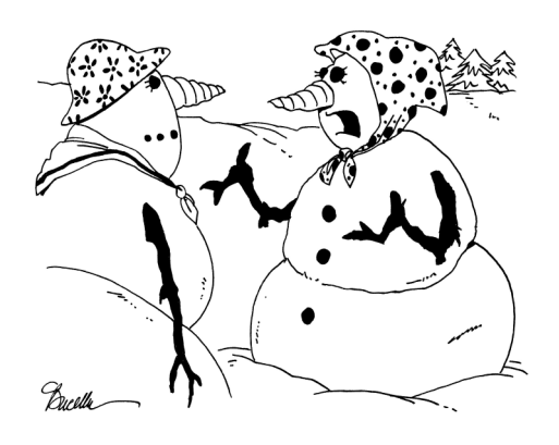
"I've put on a lot of weight, but I'll lose it all in the Spring."