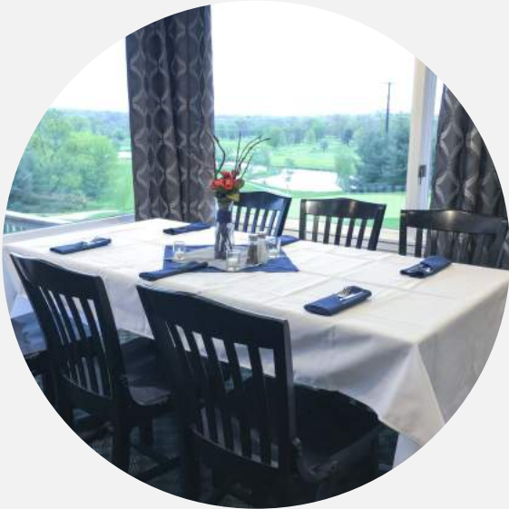
LYMAN ORCHARDS GOLF CLUB 70 Lyman Road Middlefield, CT