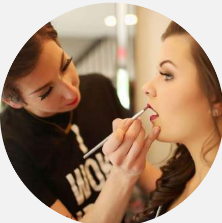
ALL DOLLED UP 218 Queen Street Southington, CT