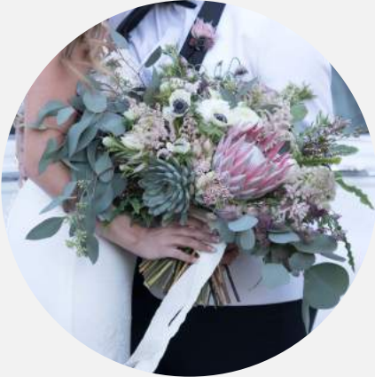
POWERSTATION EVENTS 1718 Highland Avenue Cheshire, CT