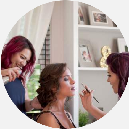
POWERSTATION EVENTS 1718 Highland Avenue Cheshire, CT