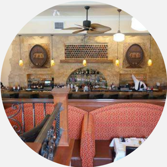
ESCA RESTAURANT & WINE BAR 437 Main Street Middletown, CT