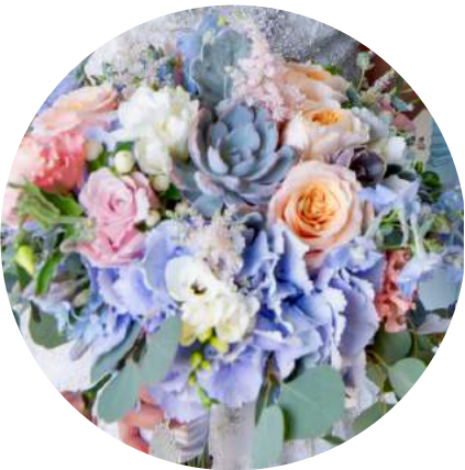
THE GREEN PETAL 350 Center Street, Suite 102 Wallingford, CT