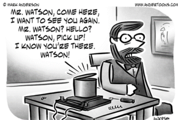
The telephone - day two.

a) Lying on his back b) Kneeling c) Standing d) Sitting