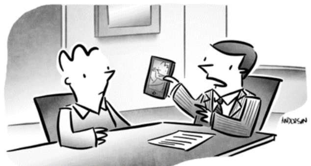
"I gotta tell you, this crime scene selfie is not going to help."