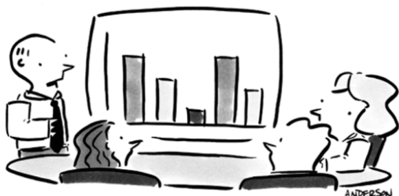
"We've gone from being in the red, to black, to taupe. Accounting is looking into it."