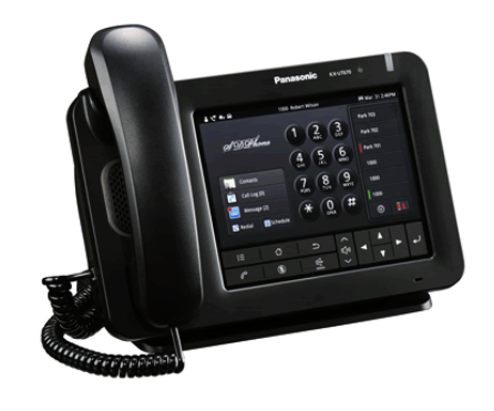
Executive Business Phone Panasonic KX-UT670 VoIP touchscreen, HD Video & Audio.