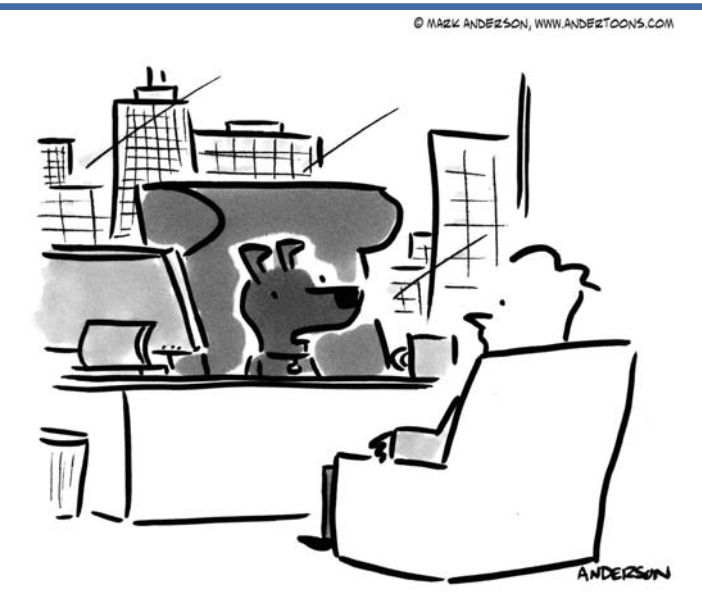
"I started out in obedience school, and I've been working my way up ever since."

Not everything needs a reply. Replying to every e-mail you get, or even a majority of them, wastes your time and the time of the recipient, especially if your reply doesn't say anything meaningful (such as a thanks or acknowledgment of a previous e-mail). Unless it's absolutely necessary to continue a conversation, move on.