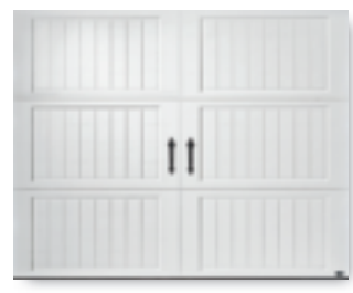
CLOSED SQUARE (C2)