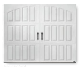
CLOSED ARCH (B1)