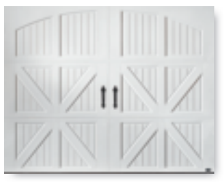
CLOSED ARCH (S1)