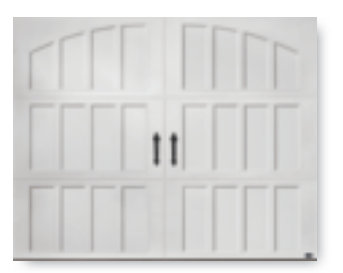
CLOSED ARCH (N1)