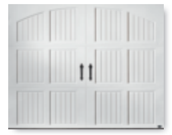
CLOSED ARCH (T1)