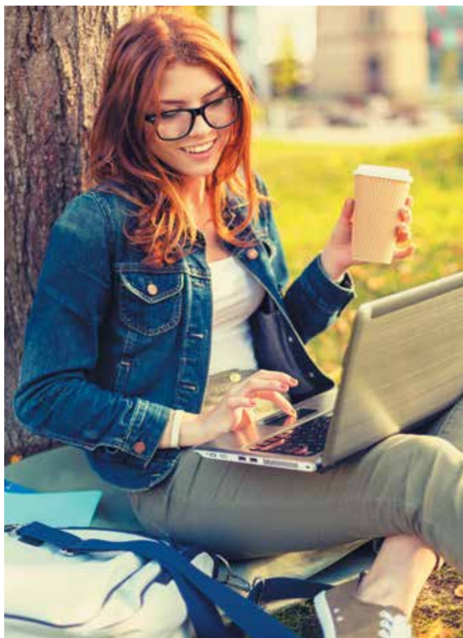
Figure out your options with VTAC's Prerequisite and Course Explorer

Not sure exactly which courses to list on your preferences? Overwhelmed by all the options? Try VTAC's Prerequisite and Course Explorer at vtac.edu.au . You can enter your VCE program and see a list of all the courses you're eligible for. You can also narrow down the results, filtering by area of interest, institution, course level, and much more.