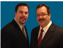
A message from the owners...

"As a Fire District, you do not have time to manage the operational AND Technical issues. That is where we have your back ! Call us and put an end to your IT problems finally & forever !"