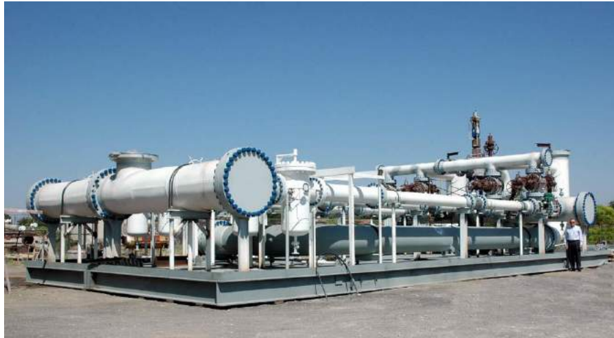
Illustration (1) Compact Meter Skid/Prover Design with 30" ball prover mounted underneath meter runs.

Typically, pipe provers built for FPSO flow rates are sized to work with flow tube volumes of 200 to 300 barrels, utilizing bulky 4-way valves, valve actuators, and large diameter launch chambers. In order to fit these oversized components onto the crowded deck or platform space, system designs were compacted to minimize the footprint. The trade-off for compact design is an overweight, jam-packed skid that creates difficulty when accessing components for field service or system maintenance. See illustration (1) FPSO example of pipe prover mounted underneath Quad-12" meter station.