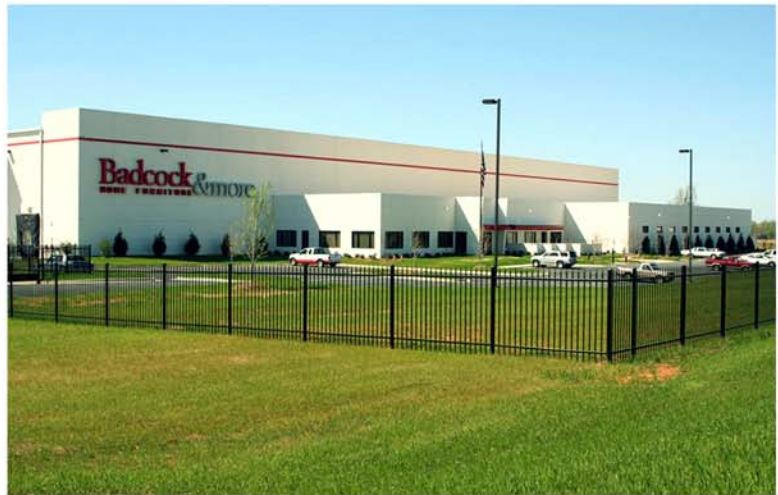
Badcock & More Home Furniture