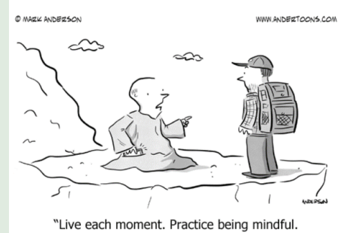
"Live each moment. Practice being mindful. Be present in... Hold on, I have to take this."