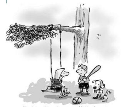
"Dad doesn't need summer off. He plays at work all day with something called mutual funs!"