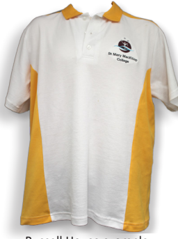
Russell House example

* If undershirts are worn, they should be white and concealed under the College uniform.