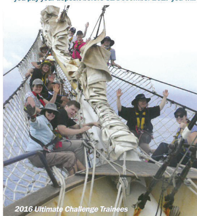
2016 Ultimate Challenge Trainees

*Please note: The 2018 Voyage fare has not yet been determined. Voyage fares will increase in 2018, however if you pay your deposit before 31 December 2017 you will pay the 2017 fare. Dates subject to minor amendments.